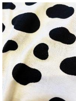
Thin and stretchy India