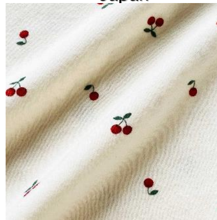
Pretty Cherry pattern