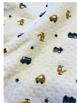
Quilt with high heat retention