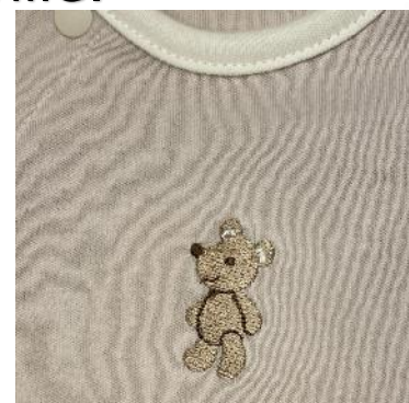
Cute bear pattern (embroidery) in Japan