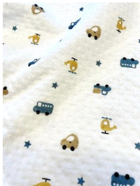
Vehicle pattern is popular with boys