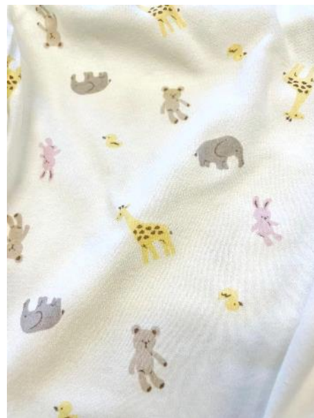
Animal pattern is popular in Japan